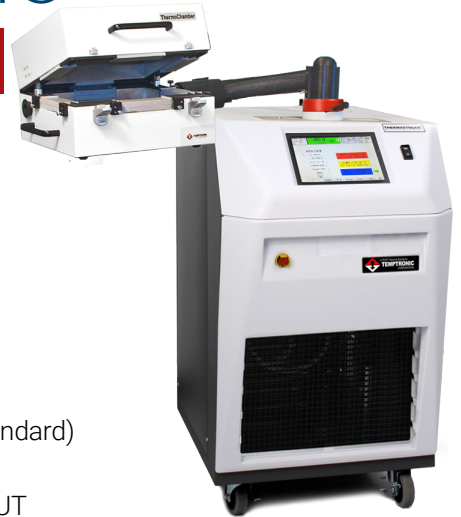
System shown with optional enclosure

Internal Diode, Thermocouples (T & K), RTD (100 Ohm platinum), Digital DUT